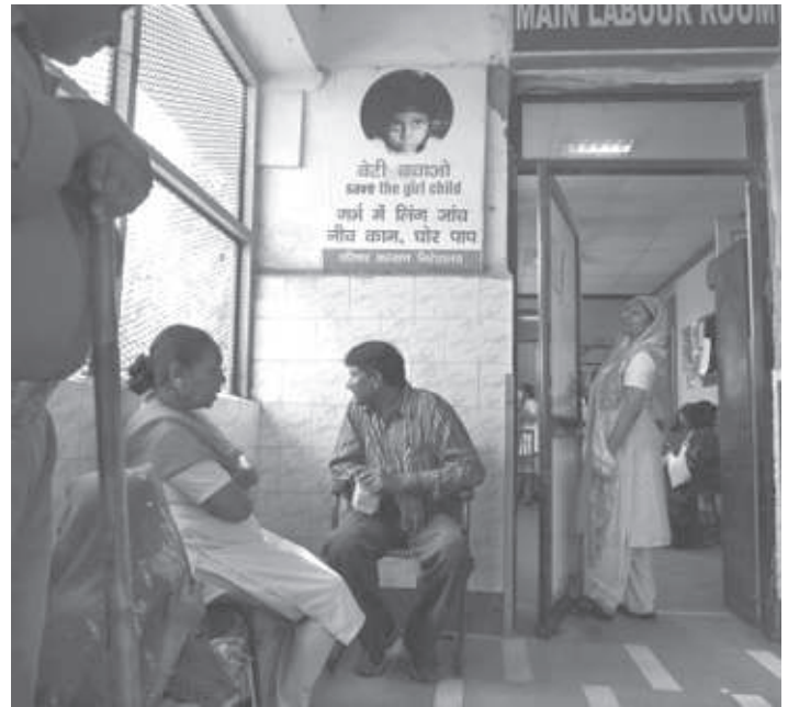
Some Indian women abort over such trivial matters as an unwanted zodiac sign.

Most abortions are not what any reasonable person would call "necessary." Nearly foolproof birth control is available to every Canadian girl from puberty onward. Few unmarried girls or women today endure crippling social stigma for pregnancy, the original impetus for legalizing abortion. Excellent prenatal care is fully funded. No woman is forced to keep an unwanted child if she would prefer to go the route of adoption. Moreover, abortion, with well-documented medical risks (few women are informed of) has never been animal-tested, the legal sine qua non for most other medical technologies and procedures. And yet, absurdly, a women's "right" to terminate any number of pregnancies at any stage for any reason at public expense and without regard to societal consequences, fathers' wishes or rights, and doctors' consciences, has become the litmus test for allegedly enlightened thinking in our culture.